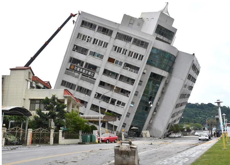
Marshall Hotel, Hualien

Next time you are in a large public indoor space, just look around a bit and imagine what might happen in a fire or earthquake and how you could stay safe.