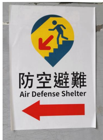
These Signs Appearing Everywhere