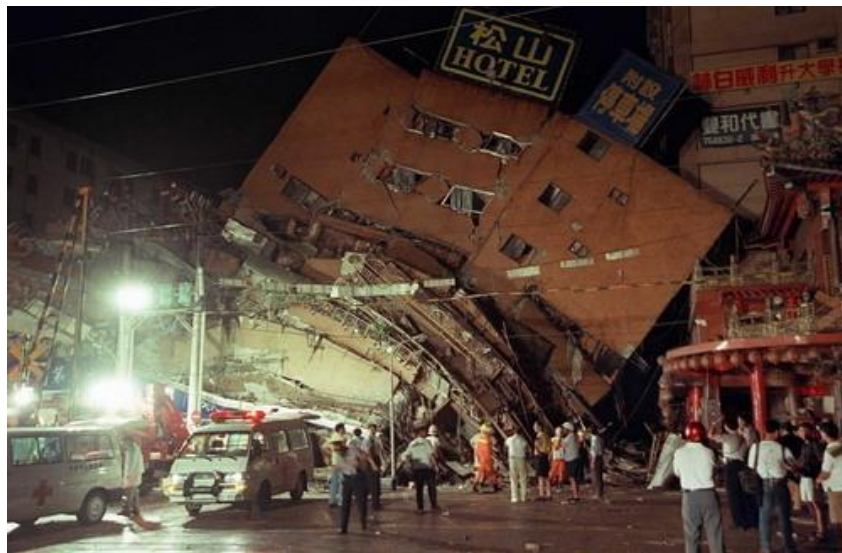
Collapsed building after 9 21 Jiji Earthquake

After an earthquake, you may need to wait for rescue; seek medical assistance; shelter in place with no running water, gas, electricity, or phone signal; or leave your building and find temporary accommodation elsewhere. Your building may be damaged so severely that it takes months of repairs before you can move back in, or it may be condemned. In an extreme quake, a large part of the country might be affected, causing chaos and delays in the recovery of basic services.