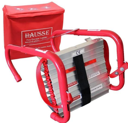
Emergency Safety Ladder

Have fire-response and evacuation plans well-prepared and shared with all household members. Take into account that some routes may be blocked due to fire or smoke, and electricity may be off i.e., it may be dark and some electrical doors may be non-functional. Do some practice drills. Be ready to transport elderly or disabled family members, as well as young children. This could mean physically carrying them down the stairs. Plan to leave heavy wheelchairs behind. You must also plan in advance where you will stay if your building is damaged and you cannot go back at once, and also if you need to make repairs before moving back in. Consider all scenarios in the following section.