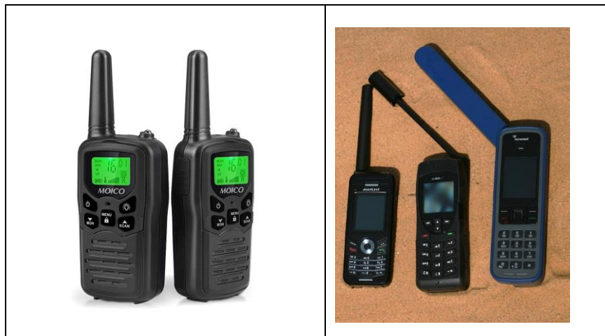
Keep Calm and Carry Comms: Left: 2-way radios; Right: Satellite phones

There are other types of off-grid communication systems as well, such as the “goTenna,” a smart antenna that pairs with your cell phone and can create a peer-to-peer decentralized communication system for sharing text messages and location information.