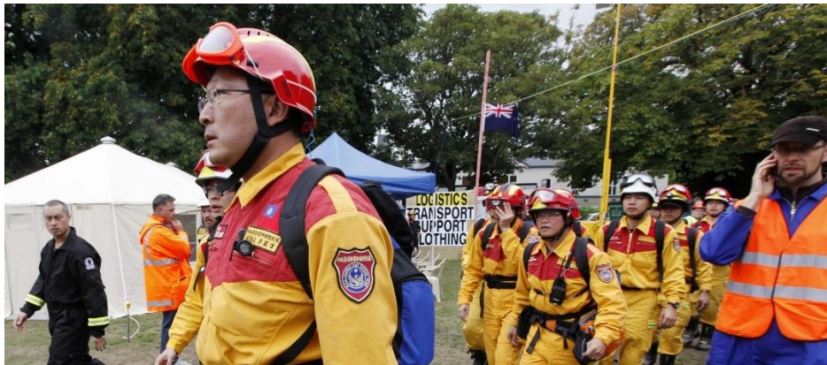
Disaster response training in Taiwan

NOTE: To be most useful in a civil defense or journalistic capacity, you would have to be organized, supplied, and prepared with your own GEP. The more dependent you are on being saved or supported, the less time and energy you have to save or support others. You should also have verifiable accreditation, and appropriate clothing, such as a vest marked clearly PRESS in English and Chinese, or the orange vest of civil defense workers, to avoid misidentification in a war zone.