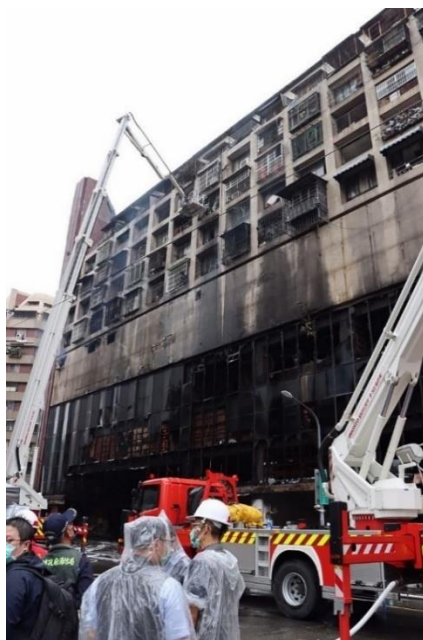
Cheng Chung Cheng Building after the fire.

Many apartment windows have anti-burglar cages, which usually have an escape door. These are often secured with a padlock, which may be old and rusted. It might be difficult to find the key during the panic of a fire. It is also common for people to place boxes, bikes, etc. in stairwells, which could make evacuation more problematic. Serious fires in commercial buildings like department stores, office buildings, etc., are rare in Taiwan. But factory fires are all too common, often resulting in injuries or fatalities, with foreign guest workers and firefighters being the most common casualties.