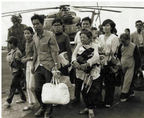
South Vietnamese refugees arrive on a U.S. Navy vessel during Operation Frequent Wind in 1975.

The State Department stresses that people should make emergency plans that do not rely on the US government. Do NOT rely on a NEO for your escape plans. NEOs generally function more smoothly than is suggested by dramatic media images like Afghans clinging onto C17s taking off from Kabul Airport in August 2021. But military evacuation on the cusp of war is inherently chaotic.