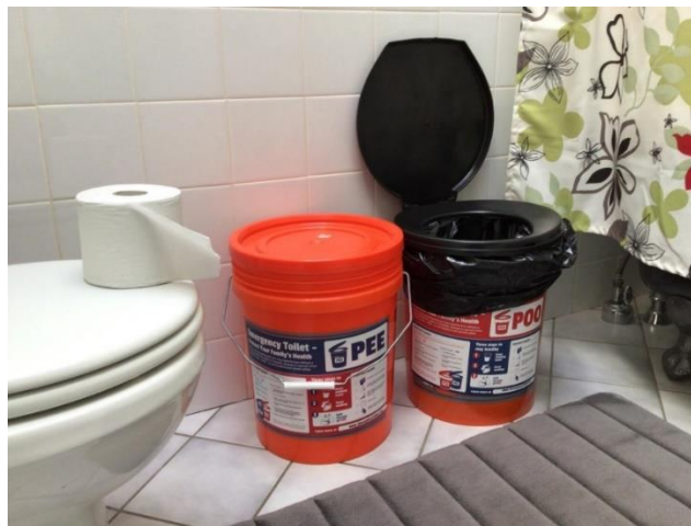
Twin-bucket emergency toilet system

Toilet waste: If you have a supply of water, and your drains are working, you can function more or less normally. But prepare for a situation where your toilet can't be used. Then you can have a twin-bucket emergency toilet system. (How-to information is easy to find online.)