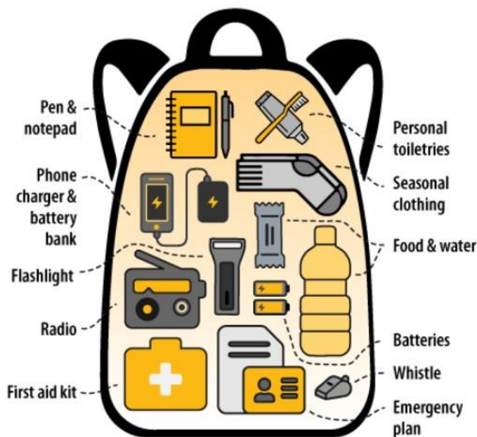
Diagram of a Typical Grab-and-go Bag