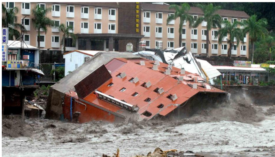
Damage after Typhoon Morakot

The “Plum Rains” - a long, stationary front off the coast of China in late spring and early summer, caused by the onset of the Southwest Monsoon - can sometimes cause flooding and landslides in Taiwan comparable to typhoons.